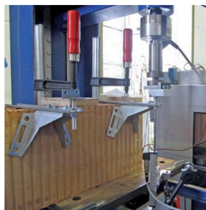
Testing of fixing material at ift laboratory